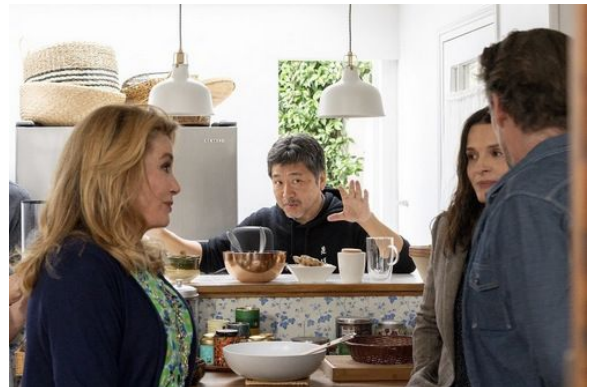
Behind-the-scenes of The Truth